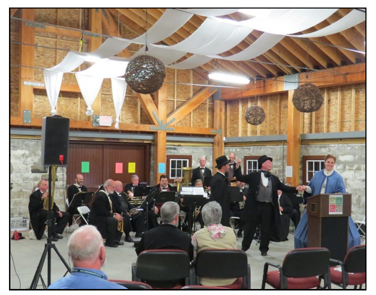
Dodworth Saxhorn Band entertains the group at the Thursday evening reception.

Oct. 23: We took the canal tour option. This was a bus ride along the course of the Clinton-Kalamazoo Canal. The canal was planned to cross the state connecting Lake Michigan and Lake St. Clair. Construction began in 1838 but ran out of money in 1843 having only reached Rochester. It was not used much if at all.