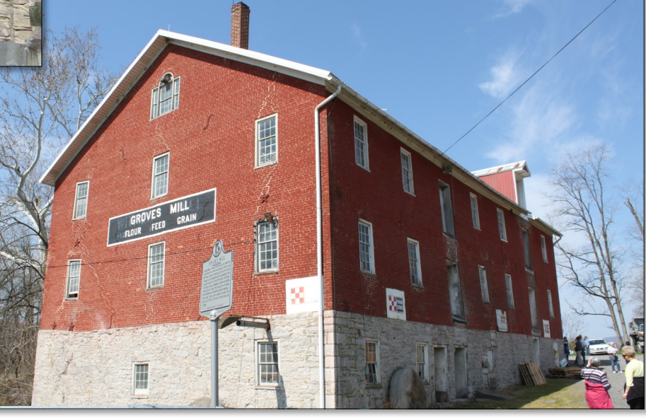
H&C Grove's Mill. <u>Top Row</u>: Owner and operator Curt Falck; An early barrel stencil remains on the interior wall ("Water Mills Family Flour, Cyrus Hoffa, Lewisburg, PA"); Curt addresses the SPOOM-MA tour group, including discussing non-GM crops (non genetically modified). <u>Middle Row</u>: A picture of the mill and reinforced tailrace, as taken from the replacement bridge; Tom Rich discusses the two mill stones remaining along the ground-floor foundation stone wall. <u>Bottom Row</u>: Rear view of the mill—note where the water enters the mill, the section of wall above it is constructed of horizontal wood board siding, the reason for which is unclear; At right, a picture of the massive mill building.